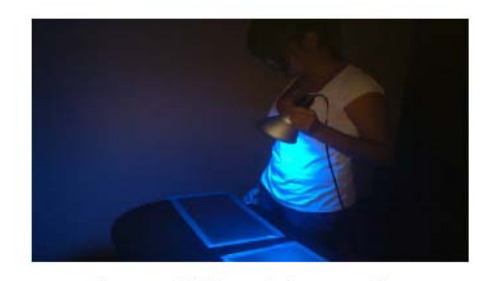
Figure 4. Visual inspection

3.3 All unnecessary obstructions in the visual field will be removed.