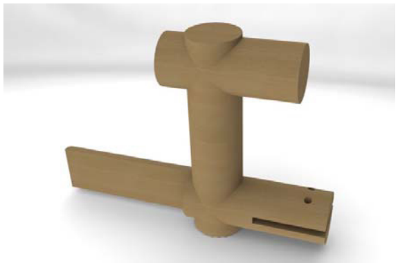
Figure 1: Cutting Tool Manual