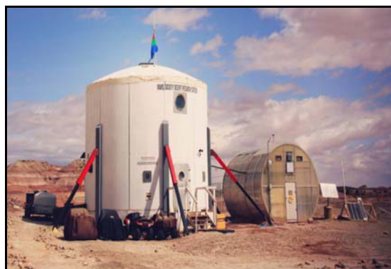
Figure 1: The MDRS: Mars Desert Research Station in Utah, U.S.A., in which the present experimental procedures were conducted.

As hopes grow for the mission to Mars, various analogues and simulations have emerged through which we are able to begin to solicit important foundational information. One of these facilities has been created and maintained by the Mars Society. Raising the funds from a number of space-oriented donors (with eventual participation by NASA), in 2000 the Society established one station on Devon Island in the Canadian High Arctic (the Flashline Mars Arctic Research Station, FMARS). In 2002 a second facility was added in the desert of Utah (the Mars Desert Research Station, MDRS). The present research was conducted in the latter facility, an illustration of which is shown in Figure 1.