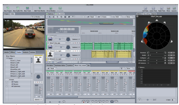
Figure 1 the interface of soundtrack pro

The proposed concept is using 3D sound to represent the traffic information in terms of road objects types, locations, movements, and distance to the personal vehicle. This exploits the possibilities of augmenting drivers hearing sense to the surrounding information. To develop the prototype of 3D sound traffic information system, we use Soundtrack Pro (see figure 1) to code sound corresponding to the road users occurred in the naturalistic driving films. There are four different types of road users are identified from the films: pedestrian, bicyclist, motorcycle, and vehicle. Different natural sounds are selected that can closely associate with the objects that the objects sound in natural environment. All sound samples are chosen from Adobe sound sample database. At the same time, another group of abstract sounds were also selected. In this group, there is not clear association of the sound and the objects it presents.