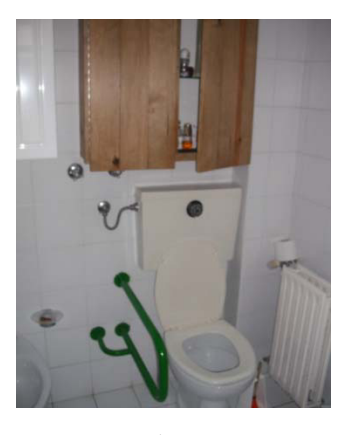
Fig.5: Bathroom - 2<sup>nd</sup> floor Home for the Elderly.

The positioning of the sanitary ware and shower presents itself as limiting agents and does not favour appropriate use by people with reduced mobility, nor does it accept a 360^{\circ} manoeuvre by wheelchair users. There is restricted access to the toilet bowl as a result of physical constraints (Figure 5) – the heater for the environment and the fixed support bar – which only allows a difficult frontal transfer, and besides being less than 0.45 m high (DL163/2006). It was observed that there is also an upper cabinet, located above the toilet bowl, which adversely affects the safety of an elderly person and is characterized as an accident risk.