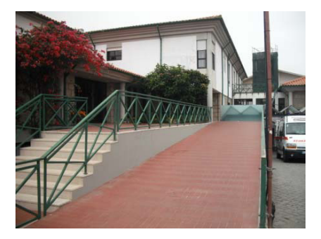
Fig.1: Home for the Elderly in Vila do Conde | Portugal

The typology of the dormitory environments is similar, regardless of the construction phase – initial design or extension – and displays only small differences as to dimensioning.