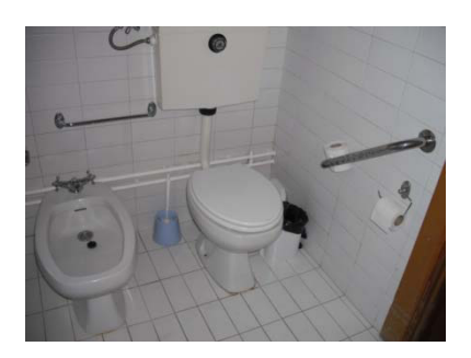
Fig.8: Bathroom - 2<sup>nd</sup> floor Home for the Elderly.

fer to the toilet bowl (Fig. 8). The unit has not undergone reform, like others, and has a bathtub. The use of the wash-hand basin is satisfactory as it permits the approach of a wheelchair.