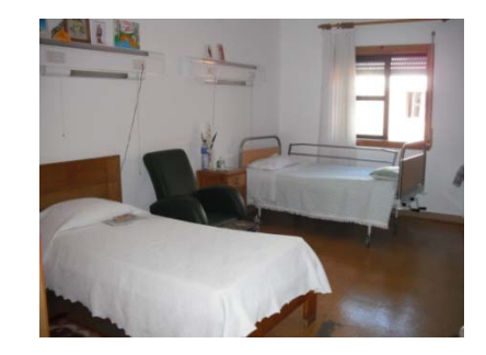
Fig.4: Bedroom - 2^{nd} floor Extension Home for the Elderly.

The 18.85 m<sup>2</sup> physical area of the bedroom meets the dimensioning of 16.00 m<sup>2</sup> for double bedrooms, as per DN 12/98, and can accommodate the furniture (Figure 4) in order to provide free access and 360^{\circ} manoeuvres for a wheelchair user. As to the furniture, it was observed that the layout identified does not keep the minimum 0.60 m distance between bed and side wall, required by law.