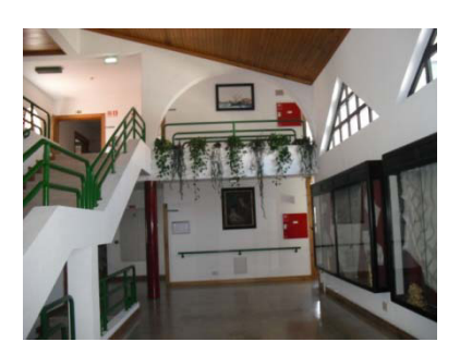
Fig.2: Hall distribution of the bedrooms - Home for the Elderly

The rooms have a capacity for 1 (one) bed, 2 (two) beds, 3 (three) beds or 4 (four) beds, in accordance with the dimensioning, and are on three floors of the building. Throughout the building, the circulation areas are equipped with iron hand-rails painted green (Figure 2), emergency and night-watch lighting and vigil, as well as fire-alarm safety devices, and sign-posting of the escape route for emergencies