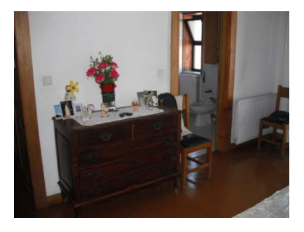
Fig.7: Bedroom - 2<sup>nd</sup> floor Home for the Elderly.

Each bed has its own light and emergency call device connected to the nursing station. Some units have furniture for personal use that fits the environment without disturbing the elderly when they move about (Figure 7).