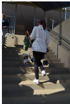
Figure 5: Mother had to carry the stroller on the stairs.

To enter the space, she climbed the stairs of the school holding the stroller and baby (Figure 05). At this point she said that only won because the gap is used to raise the baby in the stroller every day in the building where she resides, where there is no elevator.