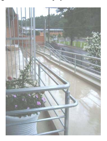
Figure 1: Main access to school by ramp. (ANDRADE, 2010)

In a first school visit, we identified many steps in