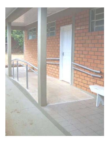
Figure 2: Acess to classroom by ramp, with handrails at two heights on both sides. (ANDRADE, 2010)