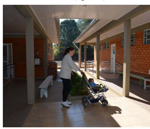
Figure 9: Mother with stroller accessing the class room

As últimas atividades a serem executadas, localizar duas salas de aula, não foi difícil em relação a orientação no espaço, visto que há um bloco somente de salas de aula bem identificado através do zoneamento. Para chegar até ele a entrevistada passou por uma rampa com leve inclinação, inserida durante a reforma ocorrida em 2010 (figura 09).