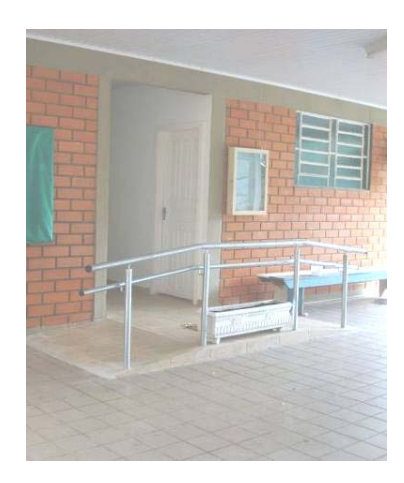
Figure 3: Ramp created to allow access in all public spaces, like secretary, teachers room, labs, library and toilets. (ANDRADE, 2010)

In the case of existing bathrooms, which were small, unable to adapt and were located next to the kitchen, we decided to turn them into the refectory. The new toilets have had their internal spaces designed according to accessibility standards (ABNT, 2004). In addition, teachers and staff also gained a new bathroom, large enough for use by people with disabilities.