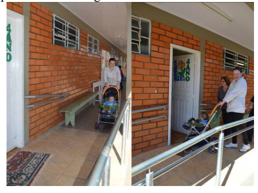
Figure 10a e 10b: Mother arriving in classroom by ramp.

she feels "safely" because in all ramps handrails were implanted in two heights.