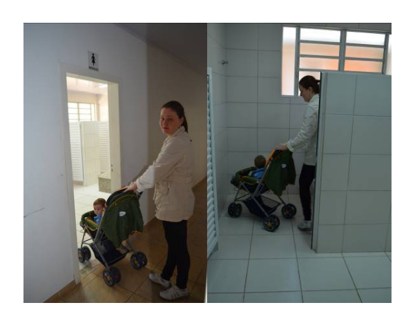
Figure 7a e 7b: Mother using accessible bathroom.

One of the activities proposed by the researchers was to find one bathroom, the Mother with baby had no difficulty in finding it. However, when she approached she said: "Must I enter here with the boy?". (Figures 07b and 07a).