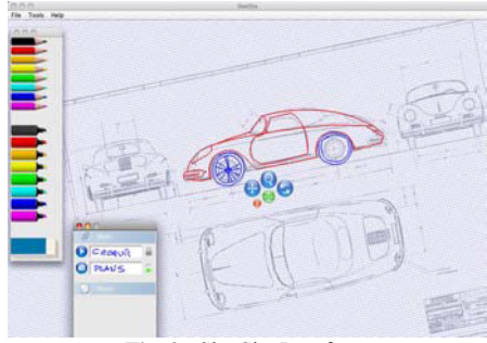
Fig. 2 : SketSha Interface.

The system is completed by a 24-inch screen with an integrated camera, which allows the participants to see and talk to each other, on an almost 1:1 scale, during a real-time conference. Pointing, annotating and drawing are possible due to the electronic pen. Social exchanges are transmitted through the external modules of video-conferencing in order to support the vocal, the visual and the gestural aspects of the collaboration.