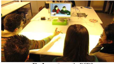
Fig. 3 : meeting on the DCDS

The system is completed by a 24-inch screen with an integrated camera, which allows the participants to see and talk to each other, on an almost 1:1 scale, during a real-time conference. Pointing, annotating and drawing are possible due to the electronic pen. Social exchanges are transmitted through the external modules of video-conferencing in order to support the vocal, the visual and the gestural aspects of the collaboration.