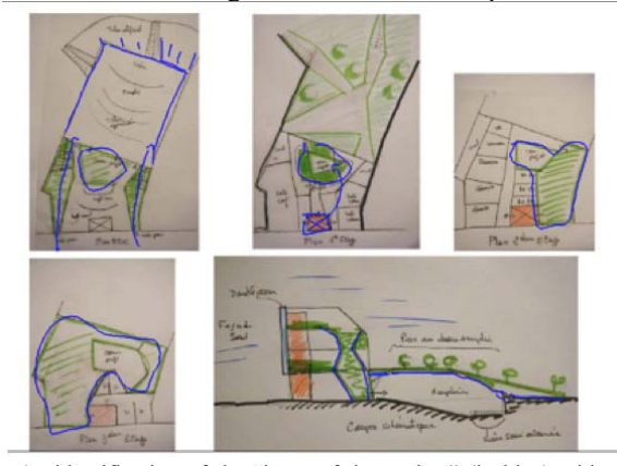
Fig. 4 : identification of the "heart of the project" (in blue) with digital annotations on previous documents (scanned pen-and-paper sketches).

cifically added on the document, but this mapping can convey a specific message, namely the identification of several drawings of a common concept.