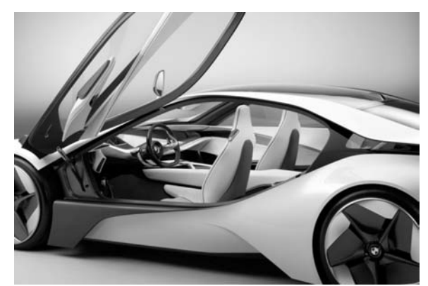
Fig. 6. The new concept car with the light weight seat.

and is a promising new way of designing seats for vehicles and will be applied in other vehicles as well.