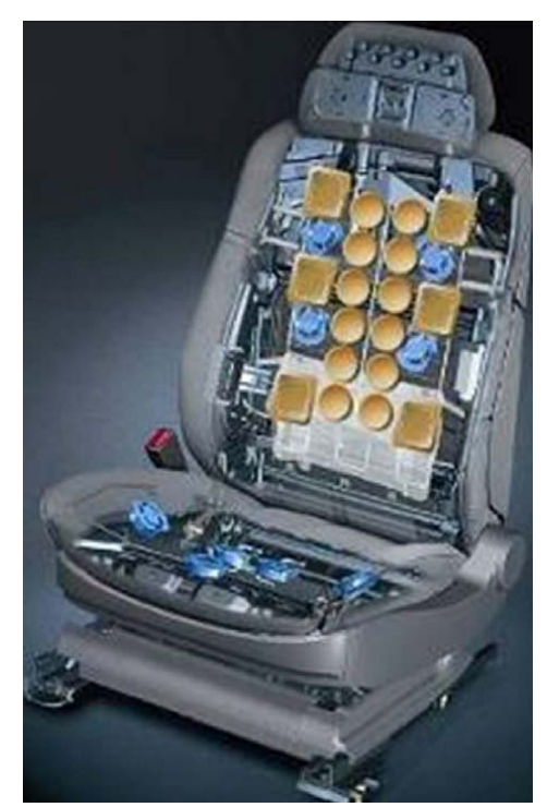
Fig. 1. The inflatable bladders in the seat used in experiment 1.

In this paper three concepts that are focused on lightweight and comfort level will be evaluated. End