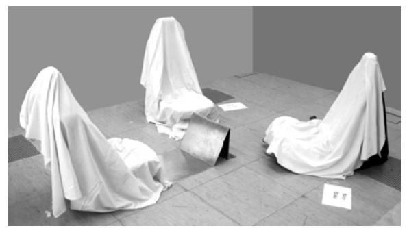
Fig. 3. The test set up for with blankets to prevent that the subjects see the chair.

sports car and the new concept seat based on the human body contour. All seats had the same backrest angle (25^{\circ}) and seat angle (14^{\circ}) . The subjects had to sit on a covered car seat for several minutes while obtaining a driving position (see Figure 3). The seats were covered with a blanket to prevent that the subjects could estimate the branding of the seat. A sloping footrest to simulate the drivers' position was provided as well. It was not allowed for the participants to adjust the seat. They had to complete a questionnaire for each seat, which included questions whether they experience the seat as comfortable, luxurious, sporty, protected and relaxed. The keywords in this experiment were a selection from the descriptive words Zenk [7] found in his research on most important aspects for car seat users. At the end of the experiment an overall opinion was asked over the three seats. The test is more extensively described by Kamp et al. [4].