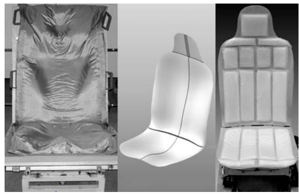
Fig. 2. Three stages in the seat development of the light weight seat: measuring the human contour (left), the CATIA 3d model (middle), the seat shell with inflatable cushions (right).

The third innovation concerned a light weight seat that consists only of a seat shell with inflatable cushions covered with a MESH material which distributes heat and humidity and a texture. It is important that the seat shell follows closely the human body contour that is in contact with the seat. Therefore, an experiment was done to determine the body contours, which were 3D scanned [2] of a group of drivers varying from P5 to P95. Based on these contours a 3D seat shell form was developed in CATIA (see Figure 2). In the working model based on this contour an inflatable cushion fills the gaps between the largest and smallest persons. To see how passengers and drivers react on this seat, a comparison of experience was made with two other seats.