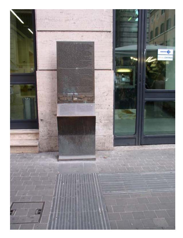
Fig. 5. Tactile map, Rome

Numerous pathways have been built in Rome with tactile signals on the ground for facilitating mobility and orientation for everyone (Fig. 6), especially at road crossings and in railway stations. The Auditorium in Rome, designed by Renzo Piano, has been equipped with tactile signs on the ground, tactile maps, and iconic and tactile signals to meet the needs of the blind and visually impaired.