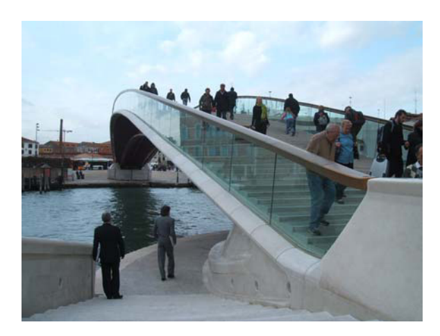
Fig. 2. Ponte della Costituzione by Santiago Calatrava, Venice

use by people with reduced mobility together with accompanying persons: definitely not a DFA solution.