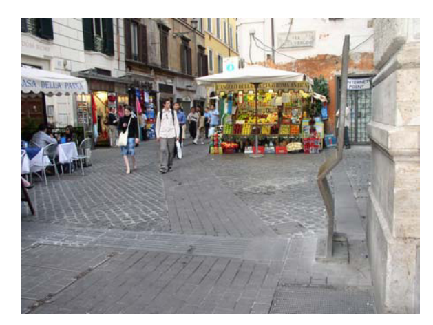
Fig. 4. Tactile path, Rome

This path has also been fitted with tactile markings on the ground and Braille and 2D maps (Fig. 5).