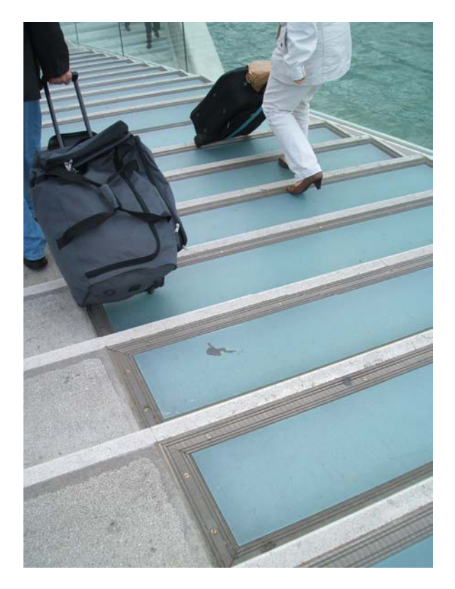
Fig. 3. Ponte della Costituzione: detail

Fatigue, adaptation to the environment with a minimum of physical effort compared to the variability of human thresholds, the need to rest also within the urban context, stimulate thought on how to address the issue of street decor and furniture and how to search for new, enhanced solutions. Several years ago, a pathway was built in Rome connecting the Pantheon to the Trevi Fountain (Fig. 4) with so-called sciatic-nerve resting points, useful for those who have difficulty sitting down and getting up.