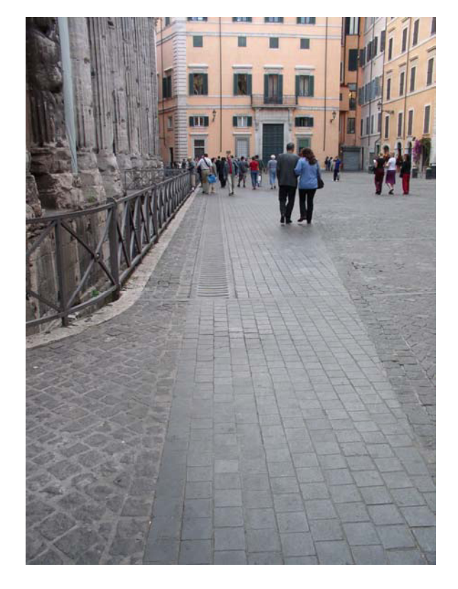
Fig. 6. Route for all, Rome

Numerous pathways have been built in Rome with tactile signals on the ground for facilitating mobility and orientation for everyone (Fig. 6), especially at road crossings and in railway stations. The Auditorium in Rome, designed by Renzo Piano, has been equipped with tactile signs on the ground, tactile maps, and iconic and tactile signals to meet the needs of the blind and visually impaired.