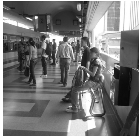
Figure 6. Final batch prototype

The objective of the second set of tests was to evaluate the relationship of use with the prototypes (conditions of usability). Tests using the basic prototype determined the height of the ischial support, taking into account people of normal height and people of short stature. A functional prototype was produced, and further evaluations were conducted. These evaluations involved observing a diverse range of passengers – male and female, young and old, people with and without reduced mobility – as they came into contact with the product which had been installed on the eastern platform of Line A at San Antonio station. These tests were conducted over a period of twenty-six days. Final adjustments were made, and a further five prototypes were produced as a pilot batch (figures 6 and 7).