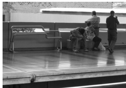
Figure 7. Prototype installed in Metro system station