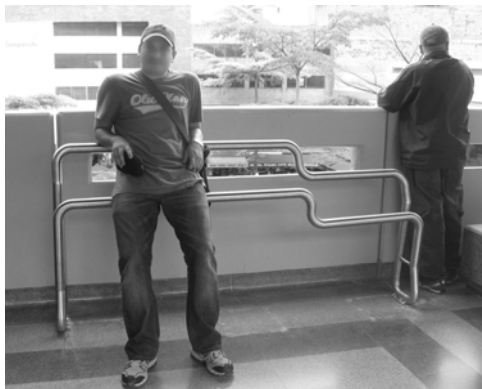
Figure 5. Prototype for user test

Once the digital model had been optimized, a functional prototype was installed on the platform for a test period of one month. The information was gathered from this prototype (figure 5) was used to make adjustments to the design. Final specifications based on materials, dimensions and installation/operational conditions were then forwarded to the client.