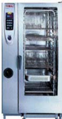
Figure 2: Example of a combination oven

□□ When asked about the performance of equipment, all respondents agreed enthusiastically that the oven served very well the expectations of working and a few comments are listed below: "You choose the option that you want to do and it determines the cooking time and does everything almost itself, " I have worked with the combination oven for 10 years and I think it only came to add, you can better control the quality of the dish, trim