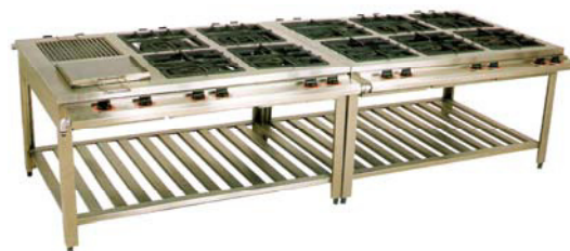
Figure 1: Example of an industrial stove market

Introductory question as to contextualize the research and confirm the initial information was asked about the performance of the equipment