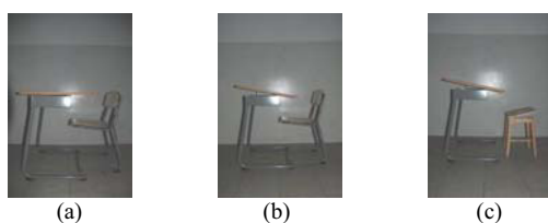
Fig. 1 - The furniture combinations analysed.

The postures adopted by school children were observed for three different situations, namely: (a) using traditional furniture (flat table and chair with 5° backward tilted); (b) with the use of a traditional chair (5° backward tilted) and table 12° tilted; (c) with a chair with seat 12° sloped forward and a table top 12° tilted (figure 1).