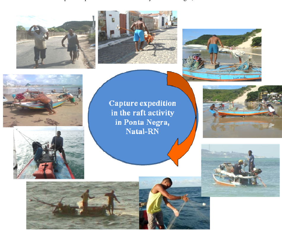
Figure 1: Capture expedition in the raft activity in Ponta Negra, Natal-RN

until they get in the ocean, using two rolls of coconut tree and cooperation of other fishermen and other roleiros. The raft is then directed, the crew come up and begin their specific procedures for navigation according to the chosen method of propulsion, sail or engine Arriving at the fishing, the fishermen cast their nets into the sea, wait for the necessary time and collect their nets, and stock the fish in particular devices, the nets are stocked in a internal compartment on the raft. Depending on the outcome of the fishery, this procedure may be repeated in the same place or in another fishing. After those procedures, the crew perform the navigation returning to Ponta Negra beach, where, after they perform the withdrawal procedures, docking and organization of the raft, commercialize the fish and return to their homes where they rest until the next capture expedition or other activity linked to fishing. Figure 1 shows a schematic representation of the capture expedition with rafts