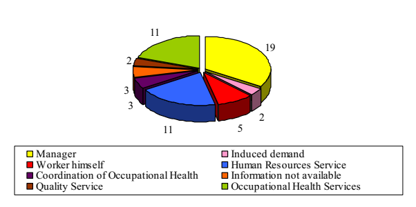
Graphic 1 - Origin of Demands (n=56)