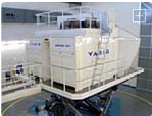
Figure. 4 Modern simulator (external)

The flight simulators play a key role in training, improvement and maintenance of the skills of pilots and crews, but also play an important role in the conception and design of new aircraft and new systems of assessment relevant to aerospace activities. The figures 4 and 5 present the modern simulators.