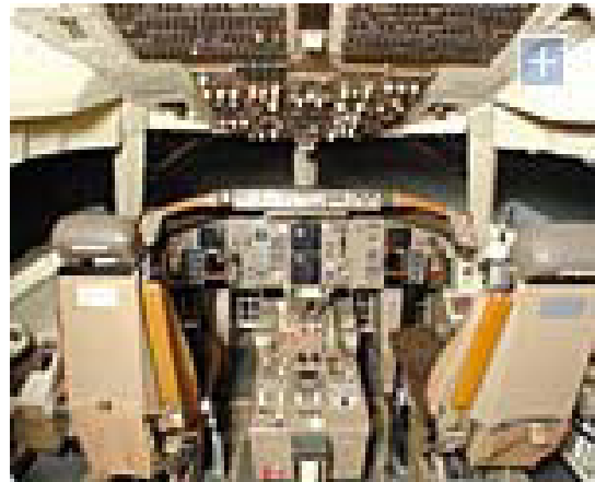
Figure 5 Modern simulator (internal)