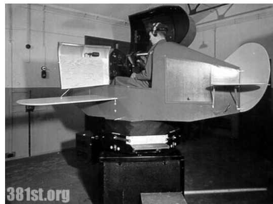
Figure 3 Simulator of second War age

The Link Trainer was a great success during the '30s. During the II war, It was produced and sold in various versions for various countries, including Japan, USSR, France and Germany. In 1937 he was given his first Coach of Link sold to an airline, American Airlines. The RAF also received his first this year Link. At the beginning of World War II, many of the largest air forces did their basic training or derivative instruments links as shown in figure 3..