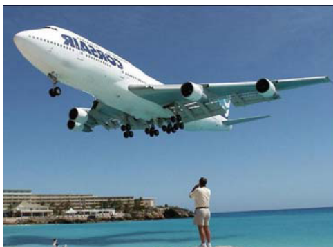
Figure 1 A critical moment of the flight – Landing

The flight simulators: a common feature of the simulator is operating in imitation of real activity. We have various levels of abstraction and human involvement in a simulation. Since the purpose of flight simulators is to simulate the behavior of an aircraft, they involve a low level of abstraction and a high level of human involvement. The essence of flight simulator is to create a dynamic model of the behavior of an aircraft allowing the human user interacts with the simulator as part of the simulation. The shape of the simulation involves a combination of science, technology and art to create an artificial reality for the purpose of research, training or fun. A flight simulator is composed of a model, real or theoretical, a device through which the model is implemented and an enforcement regime, in which the model and the device are combined using a particular goal. The Link Trainer was a great success during the '30s. It was produced in several versions. In 1937 the first Coach of Link sold to American Airlines (aviation company) and Royal Air Force (England). In WWII, the major air forces performed their basic training in links or derivatives. Procedures occur during the flight that are considered critical, as the landing (figure 1).