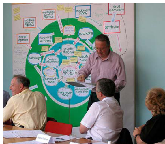
Figure 1 Systems map generation

Systems maps (see figure 1) were generated with the help of those professionals responsible for delivering and maintaining the system.