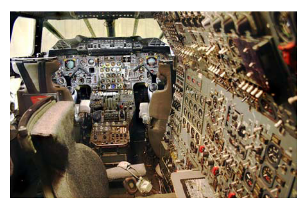
Figure 1. Concorde cockpit.

All these theories are great, but they will never eliminate the involvement of domain experts in the design process. You cannot design an aircraft if you do not have both aerospace engineering and operational aviation practice knowledge and knowhow. We are back to the complexity chapter where complex things have to be handled by expert people. The cockpit in Figure 1 looks horribly complex; it is the Concorde cockpit with about 600 instruments for three crewmen. Guess what? Twenty Concorde aircraft were built (more concretely, 14 airline aircraft), pilots learned how to use them and did not have any accident with it in 27 years of operations, except the Paris accident in 2000 that was caused by an external unpredictable mechanical event. Concorde pilots were experts and they were able to manage the complexity of this aircraft. We need to mention that to become a Concorde pilot, they had to go through the whole chain of aircraft first, i.e. knowledge gained by experience was also considered as a requirement. Analogously, climbing Mount Everest requires experience climbing many other smaller mountains.