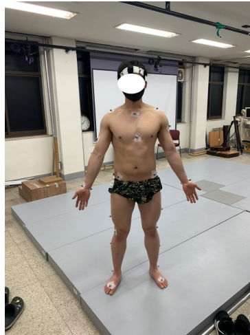
Fig. 1. Plug-in-gait full body marker set from Vicon.

pointing towards the participant. The investigator (CH) stood beside the smartphone with AIRDS to show the movements. The participant's movements included standing still and the abduction of the affected shoulder until painful.