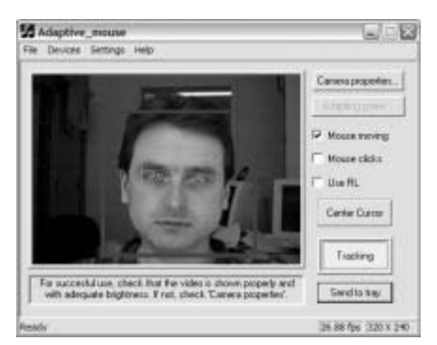
Screenshot of the headmouse application. Rectangle: area identified as the location of the head. Smaller rectangle: restricted area of feature selection. Dots on the face: currently followed features.

using radio-frequency microelectronic and mechanical (RF-MEMS) tools for position and configuration measurement and for gesture recognition.