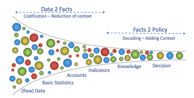
Fig. 1. The statistical value chain.

tributions in the Statistical Journal (Volumes 35, 36 and 37) from authors representing different stages and perspectives in this value chain. Basically, the following clusters of manuscripts can be identified: