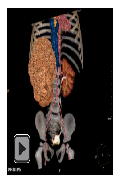
Fig. 3. 3D Reconstruction computed tomography scan of bilateral giant Wilm's tumor.

based on the Children's Oncology Group staging system in the United States [7]. Surgical procedure for removal of complex renal tumors was performed, including radical resection of tumor in right kidney, nephron-sparing surgery on left kidney tumor, plus embolectomy under cardiopulmonary bypass. The extracorporeal circulation time was 60 min and left kidney artery interruption time was 25 min. Acute renal insufficiency was occurred post-operation and recovered gradually after one course of hemodialysis. Histopathological examination of the surgical samples confirmed the favorable type of Wilm's tumor. Eight courses of anti-cancer chemotherapy administrated with vincristine, cyclophosphamide, carboplatin / cisplatine, and adriamycin / Etoposide. The patient is in good condition now 8 months after surgery, no tumor relapse, with the renal function in normal range.