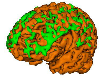
(b) left side of the brain