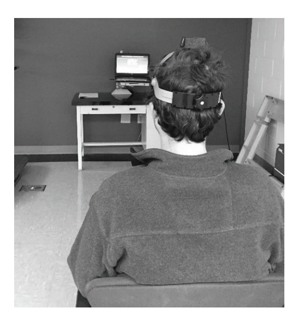
Fig. 1. Experimental set-up for dynamic visual acuity testing.

ity Index (PSQI), and the Epworth Sleepiness Scale (ESS). The concussion group also completed the Post-Concussion Symptom Scale (PCSS). Study procedures were completed in one testing session that lasted for an hour.