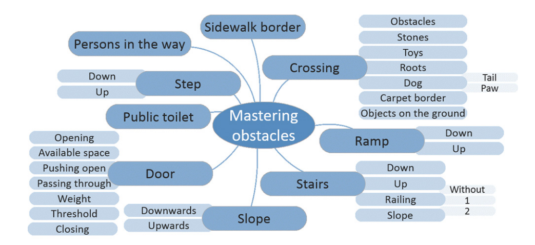
Fig. 1. Mind-map of activities mentioned by the parents and adolescents related to mastering obstacles.