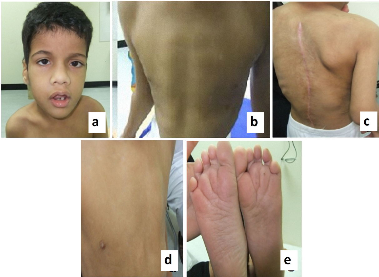
Fig. 1. Phenotype of patient showing certain key features (a) Prominent forehead, hypertelorism, strabismus, broad nasal root and wide base nose with prominent nares, open mouth appearance, everted prominent lower lip. (b) Widely spaced nipples, accessory nipple, skin pigmentary anomalies (c) Residual scoliosis abnormal position scapulae hypopigmented and hyperpigmented. (d) Whorls and streaks signifying the mosaicism. (e) Deep creases on soles.