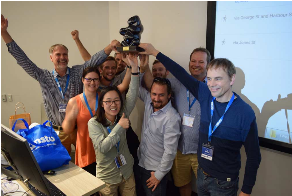
Fig. 2. Winners of the DENIM challenge which took place late on day 1 to promote team building across different facilities and disciplines. Sponsors were included. The challenge of this event was to build the Sydney Harbour Bridge using only paper, sticky tape and to decorate it. A great way to break the ice.