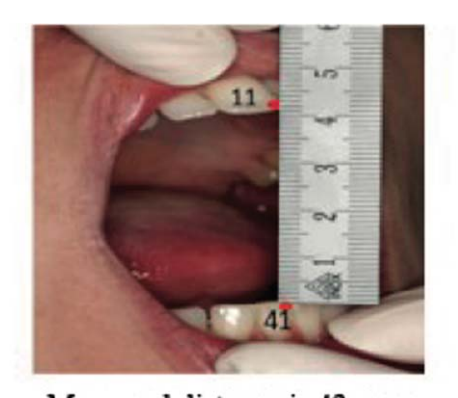
Measured distance is 42 mm