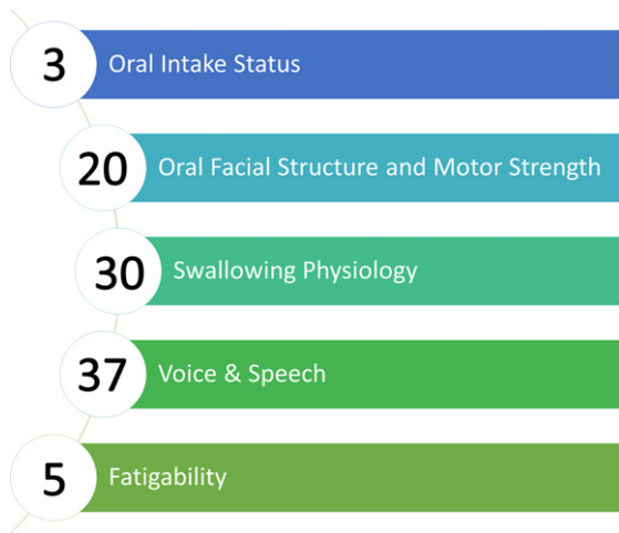
Fig. 2. Five key domains for evaluation of bulbar function in SMA. Circles include the number of items from final consensus-derived item bank per domain.

Workgroup members identified five bulbar domains of assessment relevant to SMA that were used to guide the literature review of assessments evaluating these areas: 1) Oral Intake Status, 2) Oral Facial Structure and Motor Strength, 3) Swallowing Physiology, 4) Voice & Speech, and 5) Fatigability (Fig. 2). Specifics of the nature of assessments included within the five key domains for evaluation