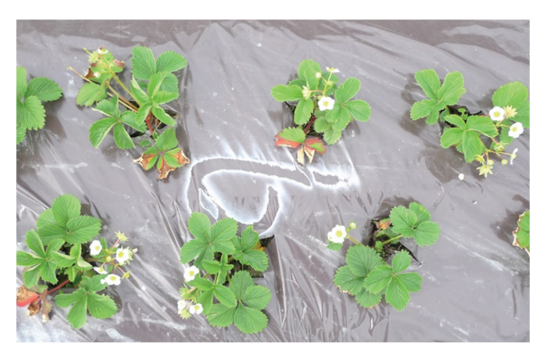
Fig. 3. Open field flowering in 2013 of 'Sonata' bare root A15 plants in Mid-Norway.