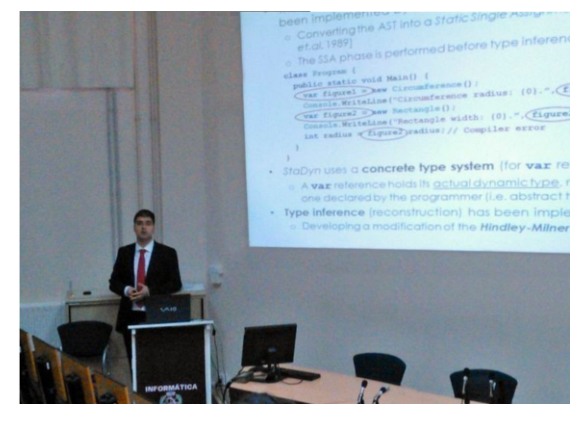
Fig. 1. PhD dissertation defense.

The research work was funded by the Spanish Ministry of Science and Innovation (project TIN2011-25978) and Microsoft Research. His four-