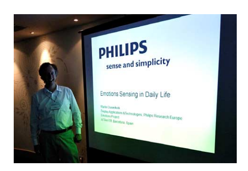
Fig. 2. Keynote Speaker.

ating false expectative about this technology. The 1st workshop of the RFID Technology: Concepts, Practices and Solutions (RFID'09) has been success in particular when considering the quality of the presentations. This could only be achieved due to the excellent work of authors and reviewers.