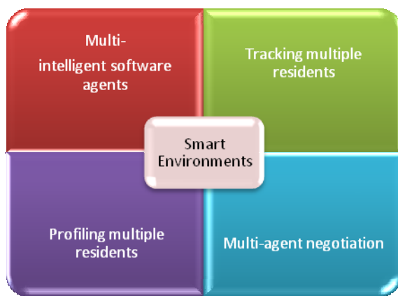
Fig. 2. Current directions in multi-agent research for smart environments.

viewed as an intelligent agent. In order to ensure that the collection of software agents is robust, transparent, and seamless, these embedded agents need to communicate and cooperate with each other.