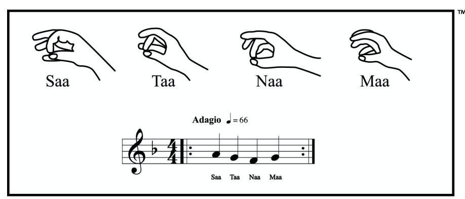
© 2003, 2015 Alzheimer's Research and Prevention Foundation Trademark of Alzheimer's Research and Prevention Foundation

The sequence is always forward: thumb to index finger, middle finger, ring finger, and pinky; never backwards.