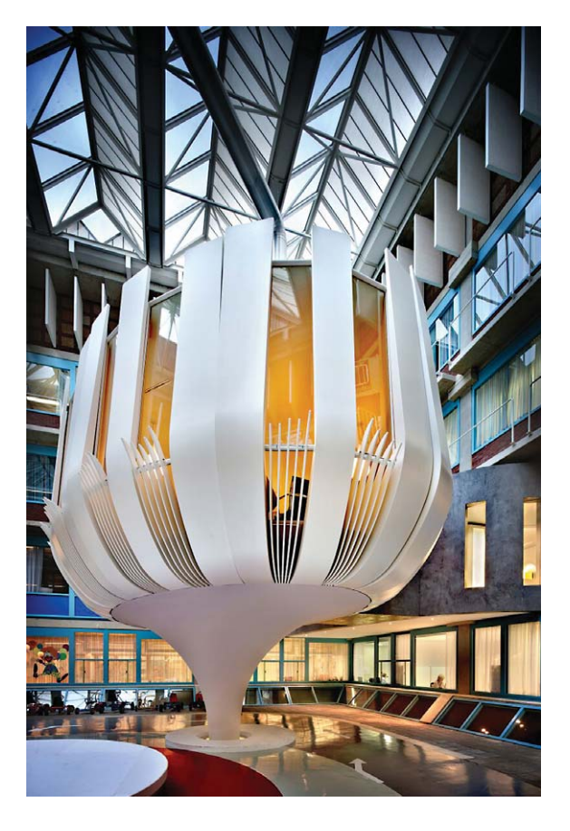
Fig. 1. The Alzheimer center has been designed and built by Leeuwenkamp Architects. The central and most remarkable part of the center is the patient lounge. Standing on a single steel pole, it looks like a lotus flower (or Dutch tulip) that 'envelops' the patients. It offers a safe area that gives comfort. This is where patients come in in the morning and are picked up for their appointments during the entire day. In between appointments, people can read magazines at the round table, chat with their family or fellow patients, or maybe relax a little by looking at the fish tank. Free lunch is served and coffee and tea are available throughout the day. All activities literally take place around the patient lounge, which reflects our motto that the patient is central in everything we do.

The VUmc Alzheimer center is housed in a dedicated unit within the outpatient building of the VUmc since September 2010, when the new facility was opened in the presence of her Majesty the queen of the Netherlands. A large grant of the Innovatiefonds Zorgverzekeraars (http://www. innovatiefondszorgverzekeraars.nl/) has enabled the