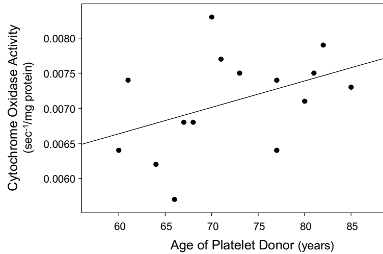
Fig. 3. Relationship between platelet donor age and cytochrome oxidase activity in AD cybrid cell lines. Younger platelet donors likely have a younger age of AD onset than older platelet donors. Cybrid cell lines made using platelets from younger AD subjects tend towards lower cytochrome oxidase V_{max} activities. Used with permission from reference [16].

gues mtDNA inheritance constitutes an AD risk factor. For a series of AD cybrid cell lines we produced on an NT2 nuclear background, cybrid cell lines containing platelet mtDNA from younger donors tended to have a lower cytochrome oxidase activity than cybrid cell lines containing platelet mtDNA from older donors (Fig. 3) [10]. If somatic mtDNA mutation acquisition was driving the AD cybrid cytochrome oxidase activity reduction the opposite relationship would be expected.