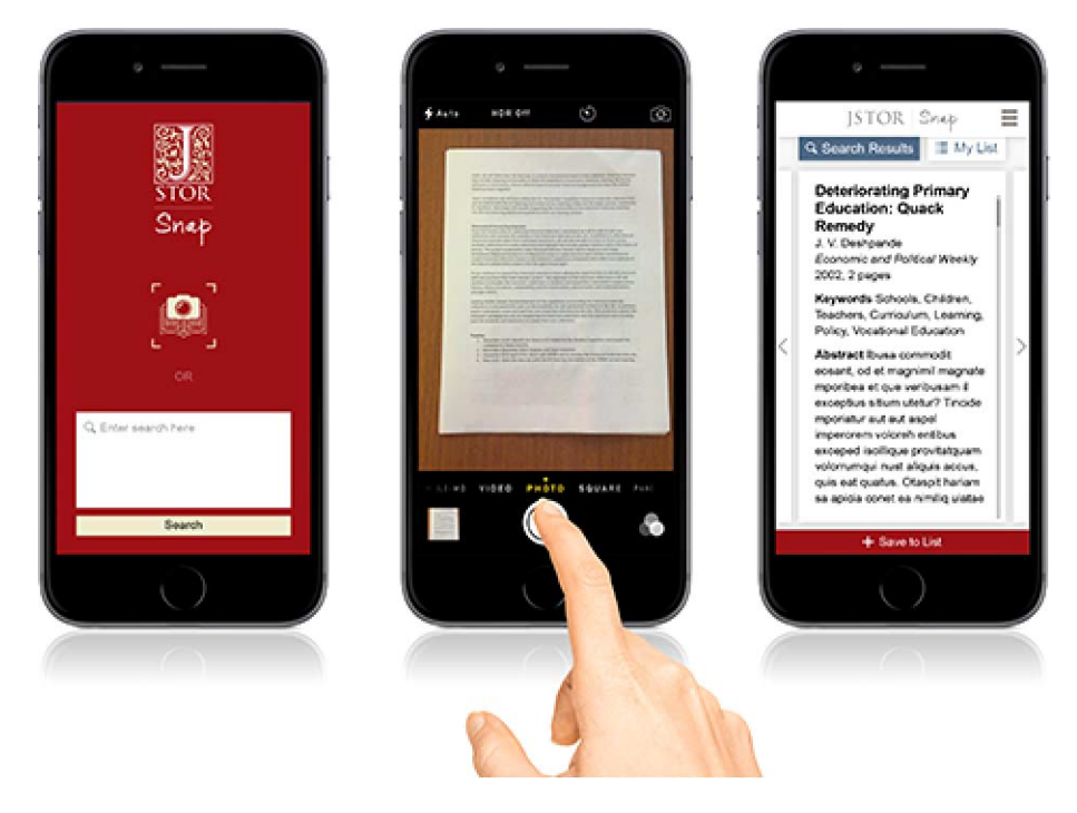
Fig. 1. JSTOR Snap was developed using a "flash build" at a coffeehouse in Ann Arbor. (Colors are visible in the online version of the article; http://dx.doi.org/10.3233/ISU-150763.)

repeatedly told us that they preferred larger screens for reading and discovering content. Regardless, we pressed on (since, in a worst case scenario, we would only have "lost" one week), deciding to build an application that would allow users to user their smart phone to take a picture of any page of text and return relevant research articles from JSTOR. Next, we refined how we would approach this idea – what set of screens, what would display on each screen, etc. – in a second series of paper prototypes. By the middle of the week we were building the application, and by the end of the week, users were giving us feedback on a designed, working prototype.