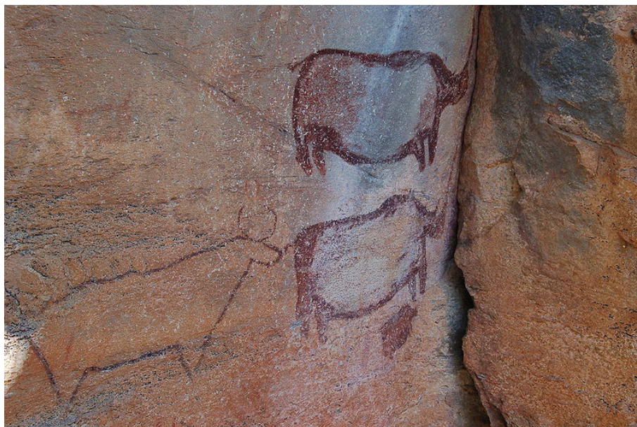
Rock paintings of Tsodilo Hills

Botswana's national Constitution makes no mention of the term “wildlife” and neither does it have any direct clauses on wildlife or natural resources. A constitution is a basic charter for a country, representing the national goals as well as the primary obligations and mandate of state and governmental authorities. It should therefore recognise a country's major resources and sectors. In Botswana, as in the US, while the existing laws are silent on wildlife ownership, they vest the responsibility for wildlife protection and management of wildlife in the hands of the state. 81 The state undertakes this stewardship by promulgating laws protecting wildlife