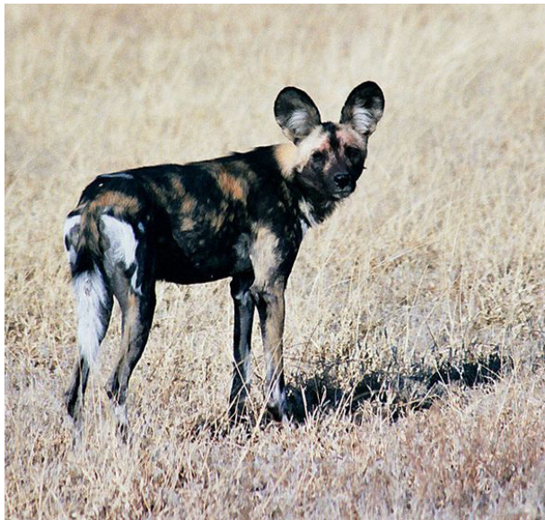
Wild Dog in Kalahari National Park

Indeed land-use regulation and zoning laws can be one of the best ways for controlling wildlife damage in Botswana, as they direct the manner in which important areas are used for conservation. Before the coming into existence of public control over the use and development of land in the country, landowners were free to use their land as they wished, subject only to any limitations in the grant under which they held it and to obligations placed upon