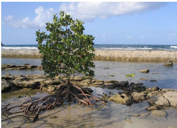
A red mangrove, Rhizophora sp.

According to the World's Mangroves 1980–2005 , recently released by the UN/FAO, the world has lost around 3.6 million hectares of mangroves since 1980, equivalent to a 20% loss of this