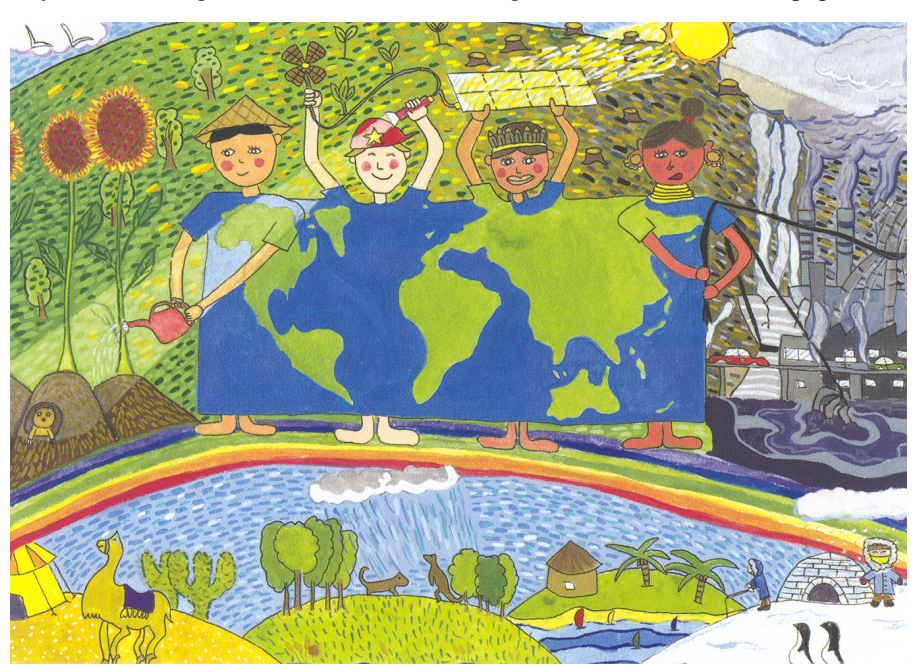
International Children's Painting Competition on the Environment 2007: "Climate Change" – a project under the UNEP-Bayer Partnership

By developing a vision of environmentally sustainable global growth, which includes sustainable use of natural resources, the multilateral system can respond to the concerns of a much larger section of the world's population