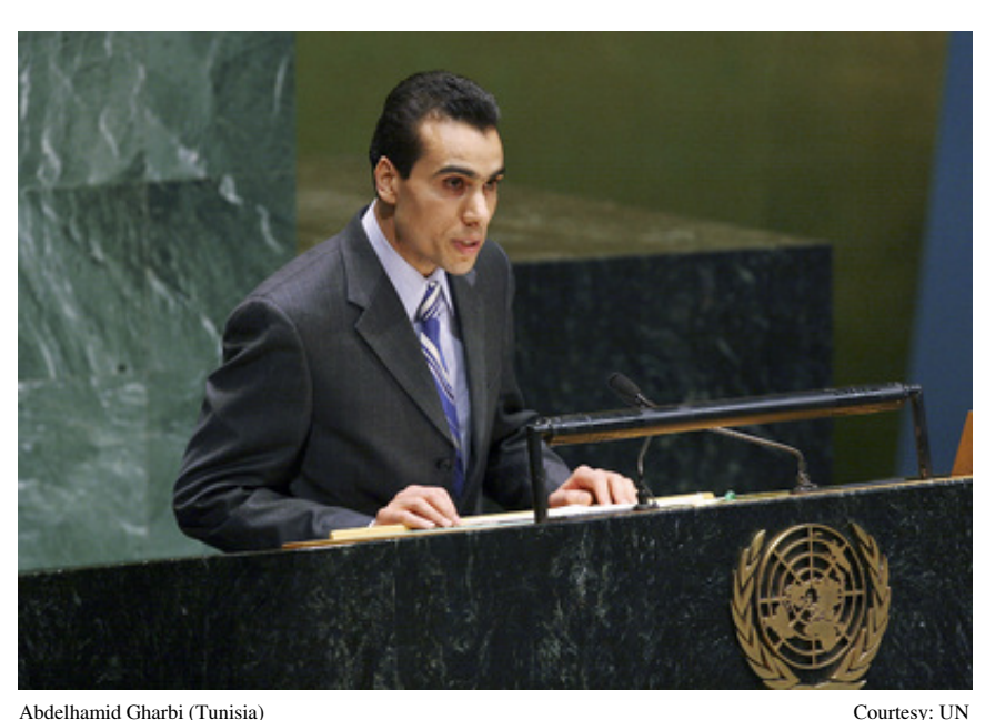
Abdelhamid Gharbi (Tunisia)

On 8 November, the Assembly elected 18 members to the UN Economic and Social Council (ECOSOC) to serve for three-year terms beginning 1 January 2008: Brazil, Cameroon, China, Congo, Iceland, Malaysia, Mozambique, Moldova, New Zealand, Niger, Pakistan, Poland, Republic of Korea, Russian Federation, Saint Lucia, Sweden, United Kingdom and Uruguay. The new members were elected as following: four from African States; four from Asian States; three from Eastern European States;