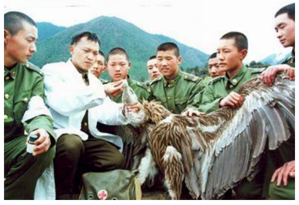
Officers and soldiers were feeding medicine to the eagle

"The Security Council recognizes that UN missions and peacekeeping operations deployed in resource-endowed countries experiencing armed conflict could play a role in helping the governments concerned, with full respect of their sovereignty over their natural resources, to prevent the illegal exploitation of those resources from further fuelling the conflict. The Security Council underlines the importance of taking this dimension of conflict into account, where appropriate, in the mandates of UN and regional peacekeeping operations, within their capabilities, including by mak-