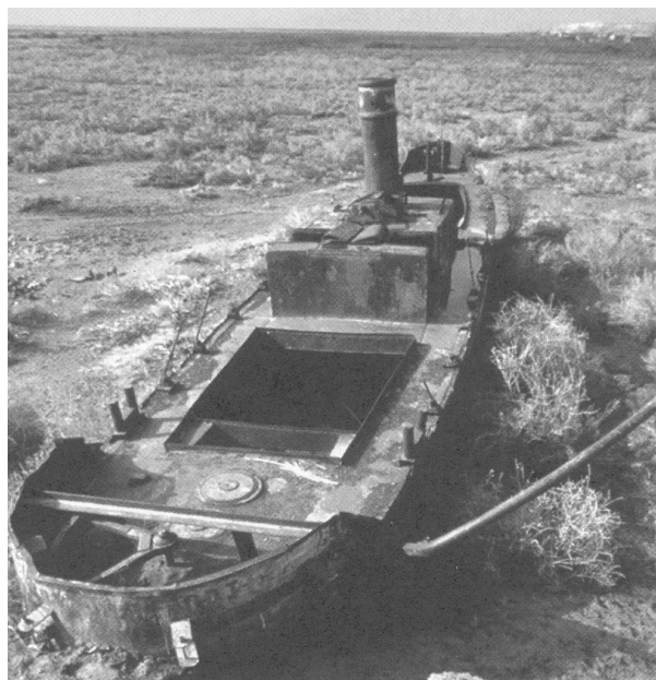
Photo above shows an abandoned fishing boat in what was once the Aral Sea

It can be seen from this analysis that formal requirements for public participation exist in the legislation for the drafting of laws and normative acts, for commenting