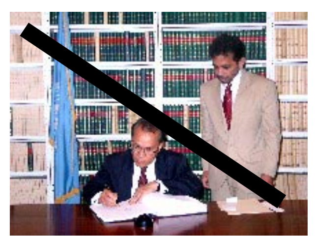
Permanent Representative of Malaysia Hasmy Agam signs the Stockholm Convention in the presence of the Chief of the UN Treaty Section, Palitha Kohona

All correspondence relating to depositary responsibilities continues to be individually produced, although an increasing reliance is placed on database-derived precedents. The electronic copy of the Multilateral Treaties Deposited with the Secretary-General is updated daily as treaty actions relating to treaties deposited with the Secretary-General, unless they require in-depth analysis or translation, are processed on the day of the action.<sup>57</sup>