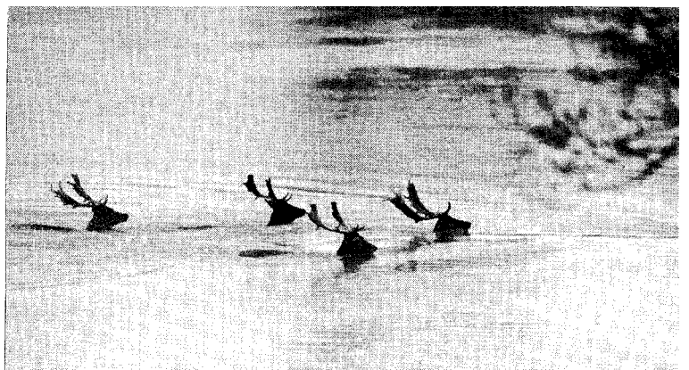
Iperiled by floods due to the unseasonal weather in England this spring, deer attempt to swim to safe, dry land.

Whilst this action by members of the petroleum industry is remarkable, major companies in many other fields