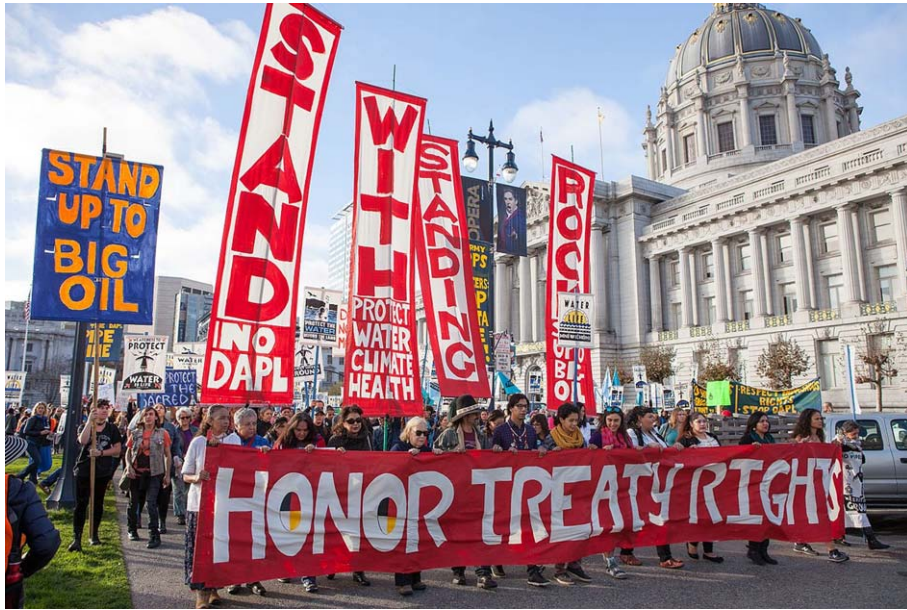
Fig. 3. Standing Rock solidarity march in San Francisco, November 2016.

these laws mandate harsh charges and penalties for exercising constitutional rights to freely assemble and to protest. 20