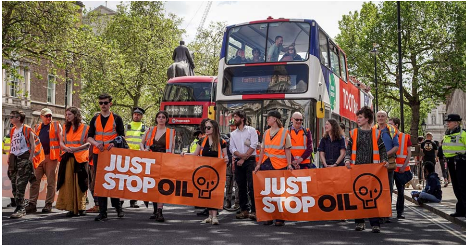
Fig. 4. Just Stop Oil activists walking up Whitehall towards Trafalgar Square on Saturday 20 May 2023.