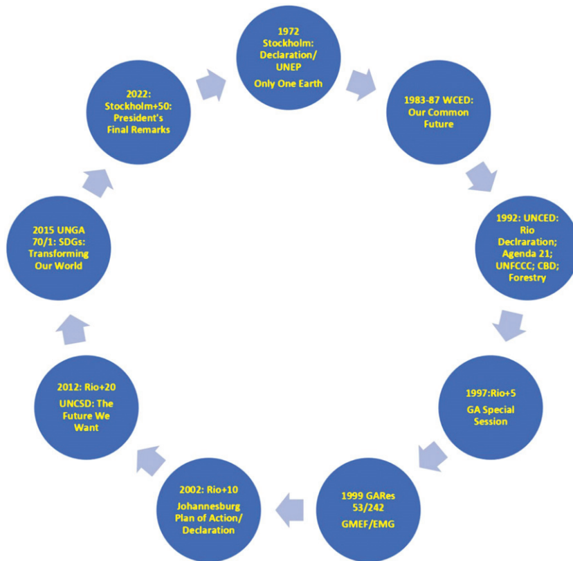
Fig. 1. UNGA's Role in Global Environmental Conferencing, 1972–2022.

two back-to-back global processes for MDGs (2000–2015) 20 and SDGs (2015–2030) 21 underscore that there are Limits to Growth 22 on this beleaguered planet. There may be legal quibbling over SDGs' normative value. Still the SDGs provide a beacon of hope as sustainability agenda has risen like the proverbial Sphinx from in the aftermath of the 1992 Rio 23 and the 2012 Rio+20 24 Summits (see Fig. 1: UNGA's Role ).