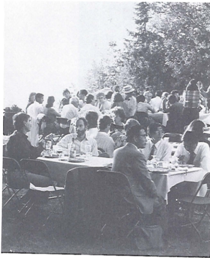
Salmon Barbecue on the grounds of the Museum of Anthropology, University of British Columbia.