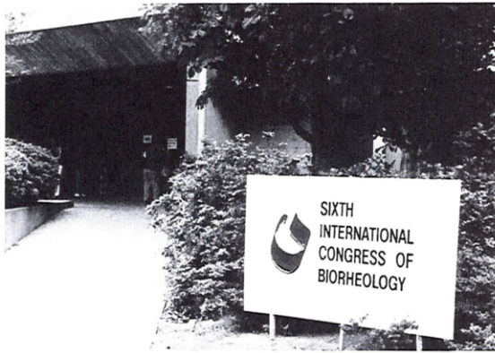
Entrance to W.H. Gage Residences at the University of British Columbia.