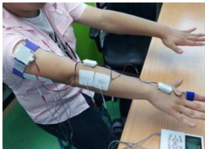
Fig.1 Experiment setup

Digital bandpass filter with passband of 3-12 Hz was used to eliminate low frequency drift and high frequency noise in the sensor signal [17]. Angular velocity of a joint \omega_j was derived from those of