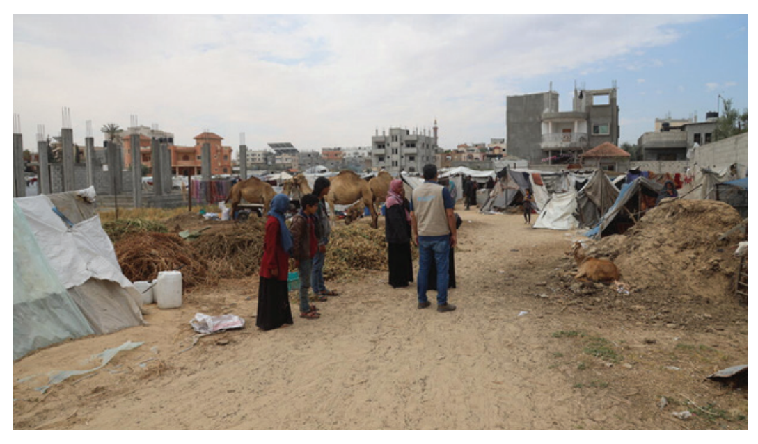
Livestock-holding farmers and herders in Rafah, Gaza Strip, receive animal fodder distributed by FAO to support local food production in April 2024 (see Environment News Futures)