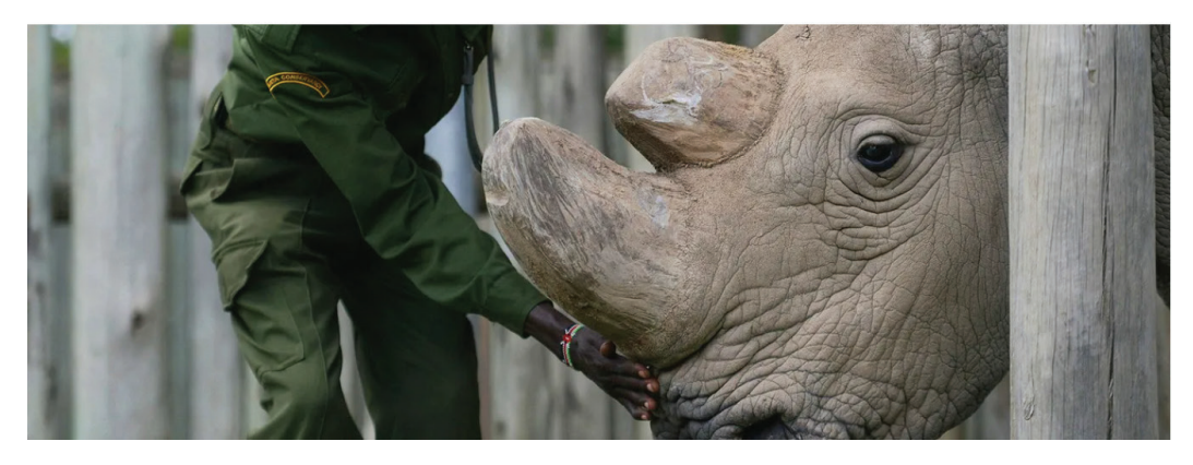
Sudan, the world's last male northern white rhino, died in 2018. In his final years, he became a global celebrity and conservation icon, helping raise awareness about the brutality of poaching.