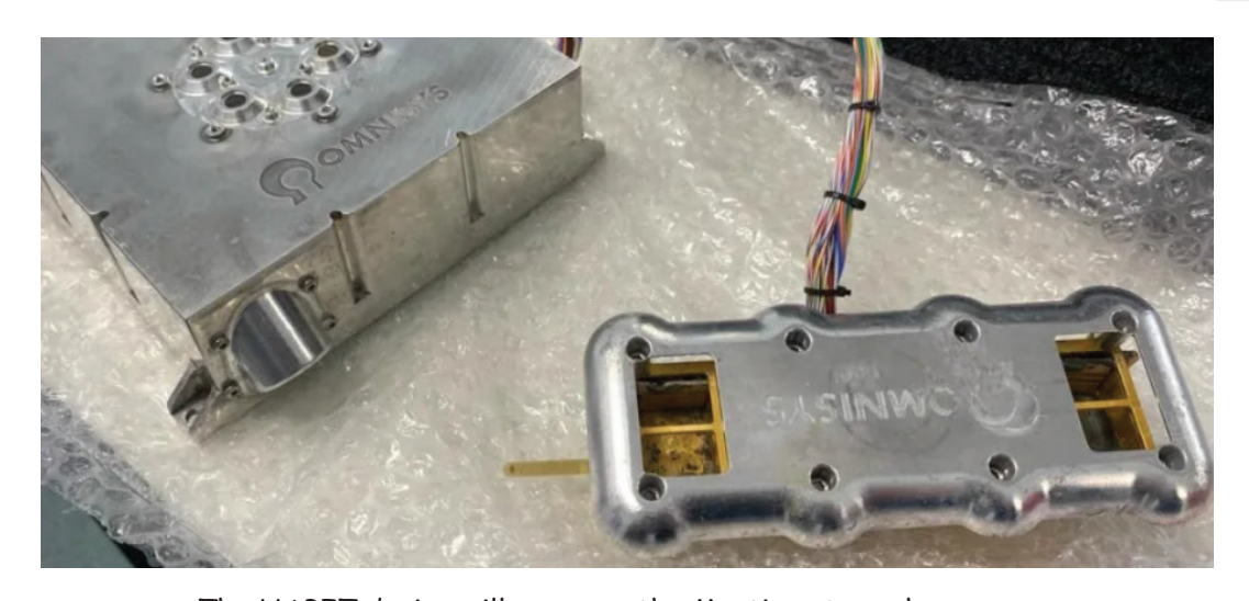
The HABIT device will measure the Martian atmosphere.